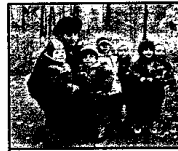
Children pose with a caregiver at a Russian Orphanage